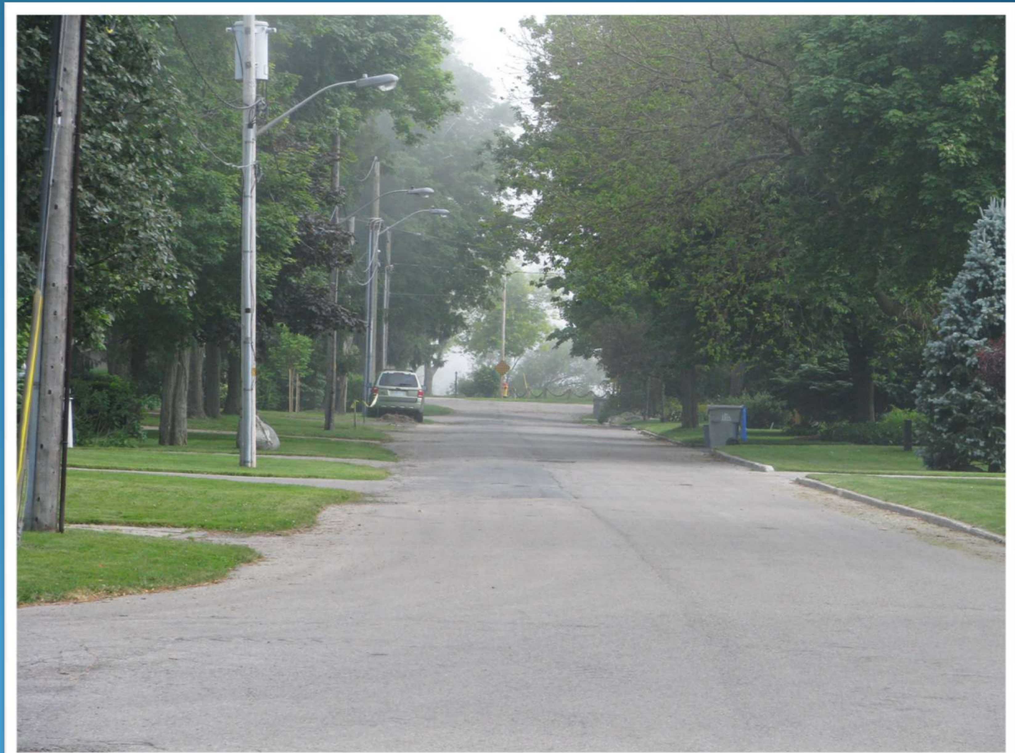
View South (From Cayley Street)