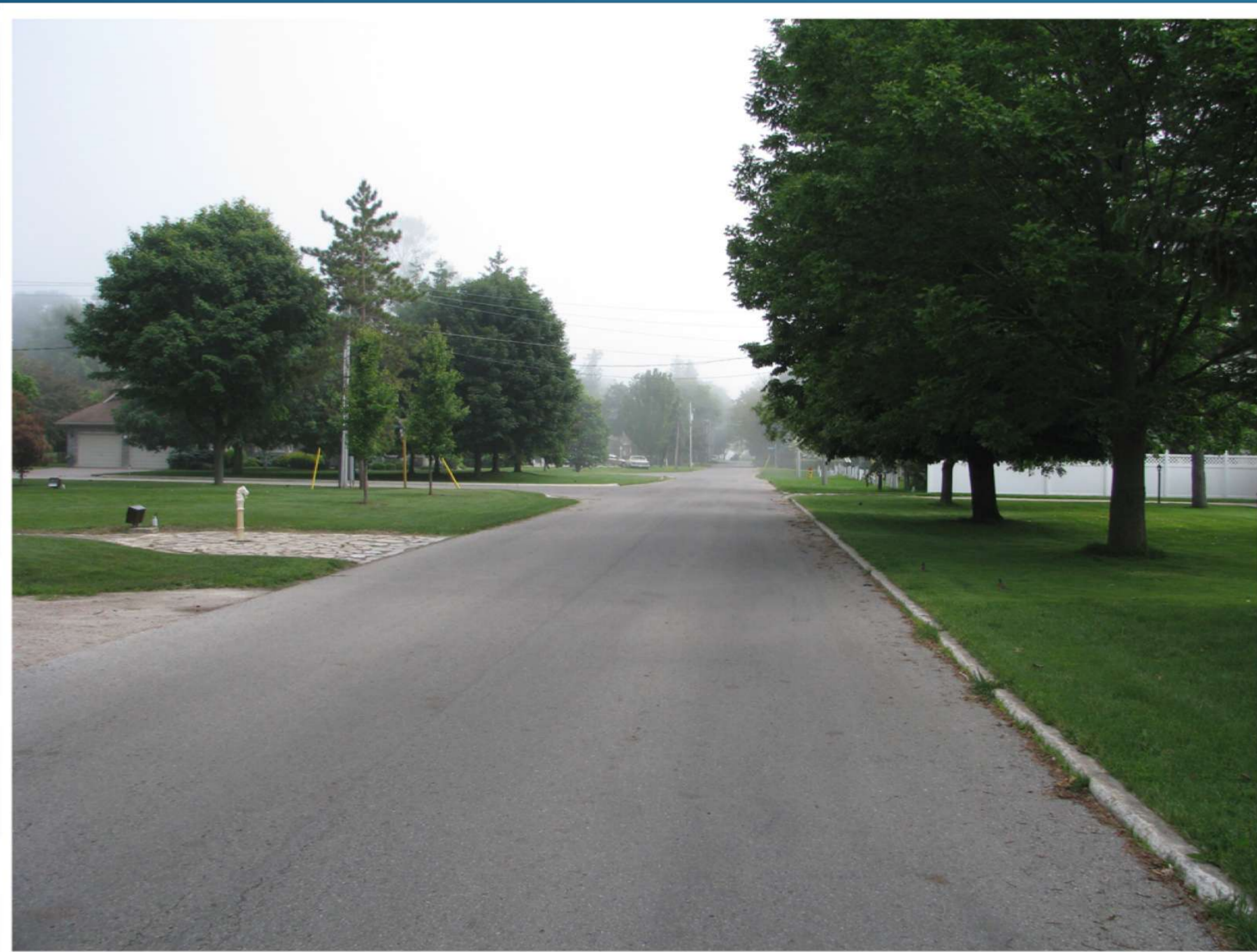
View South (From Elgin Avenue)