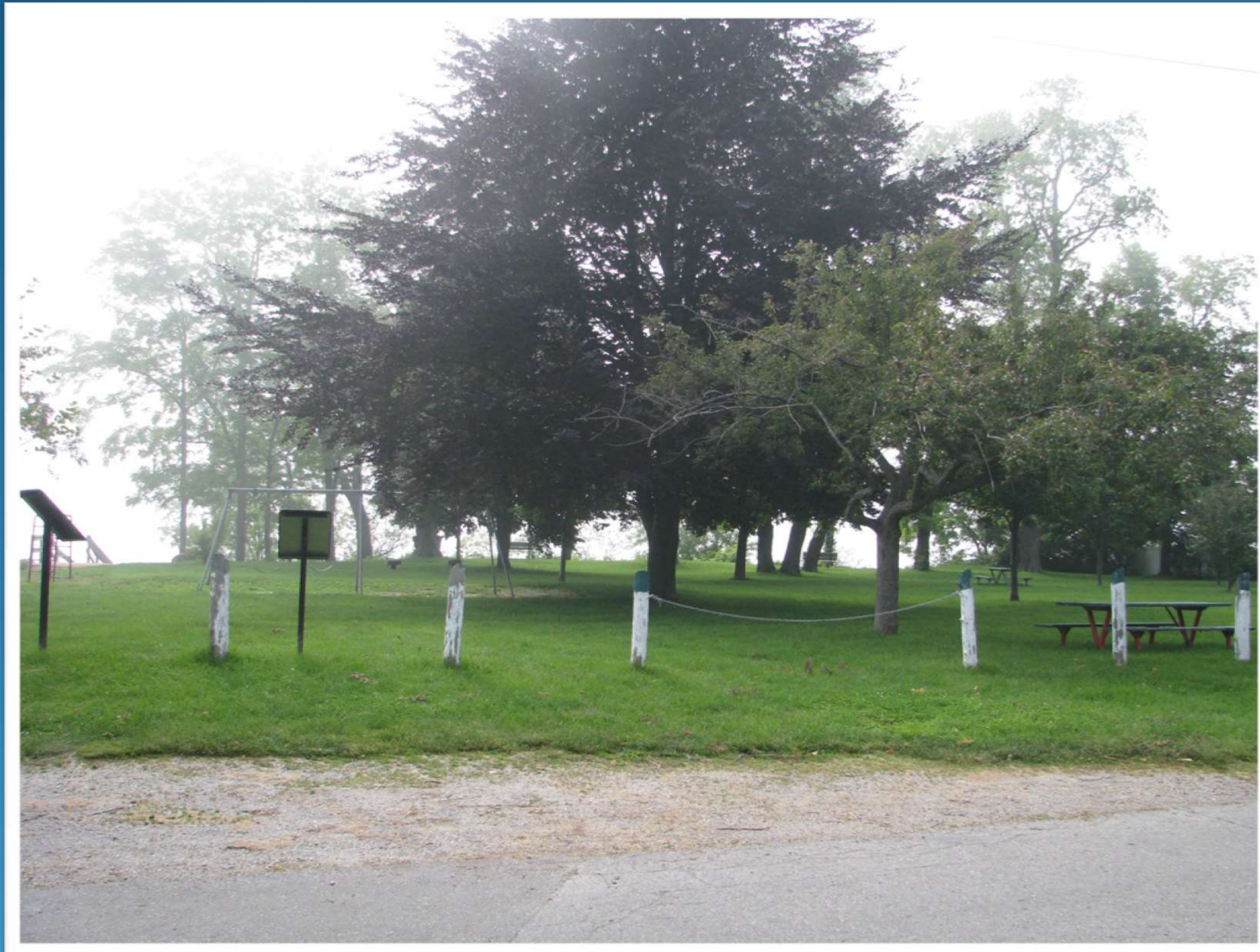
View West (From Essex Street)