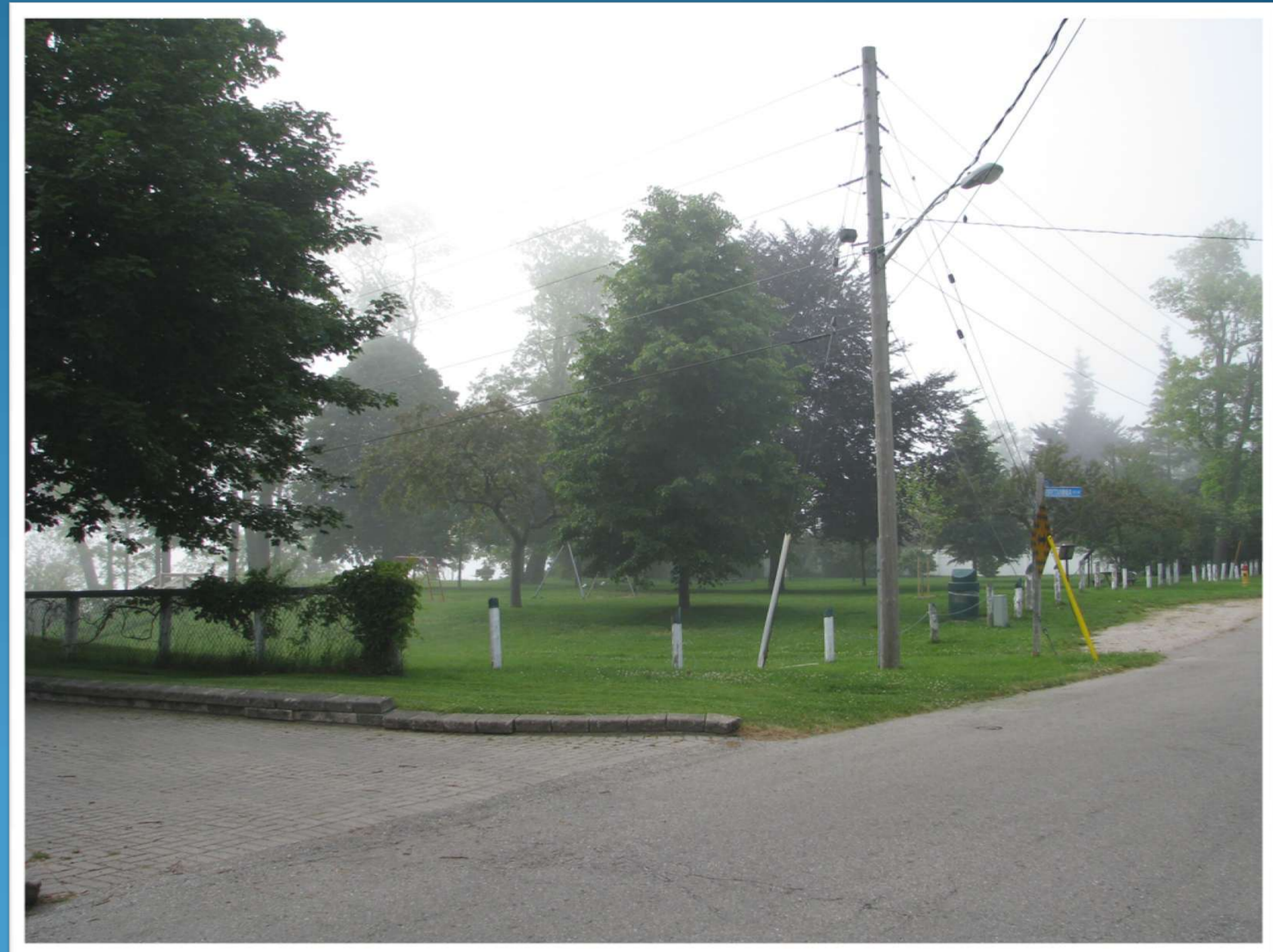
View Northwest (From Essex Street)