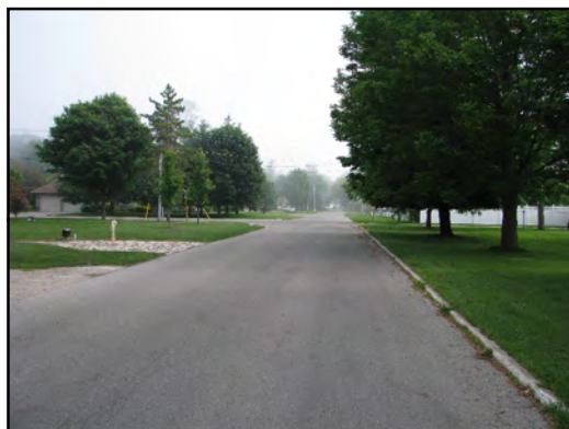
ESSEX STREET CORRIDOR (VIEW SOUTH FROM ELGIN AVENUE)