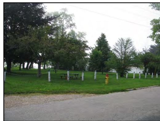
SUNSET PARK (VIEW NORTHWEST FROM ESSEX STREET)