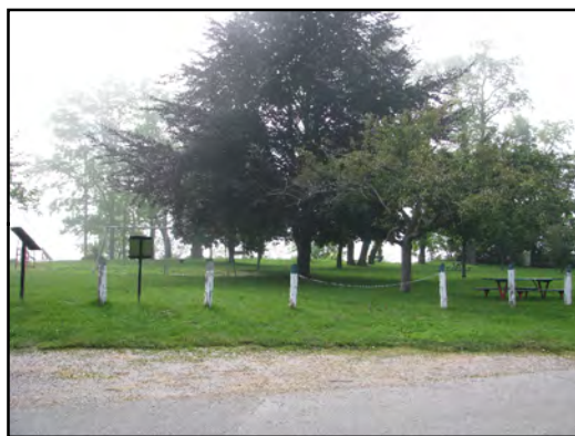
SUNSET PARK (VIEW WEST FROM ESSEX STREET)