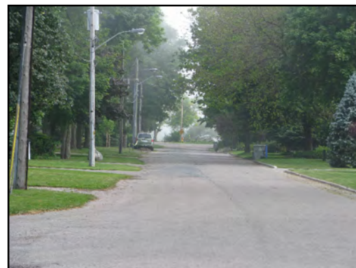
ESSEX STREET CORRIDOR (VIEW SOUTH FROM CAYLEY STREET)